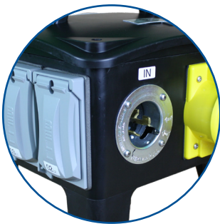
Solid Rubber Construction