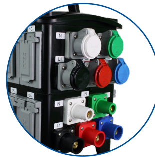
CAM In & Feed-thru