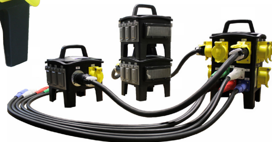
50-300-Amp Nonmetallic Distribution System