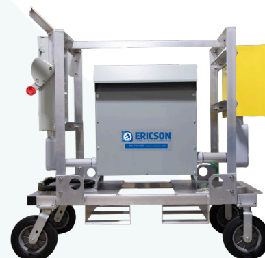
30-75kVA, 4-Wheel PTU