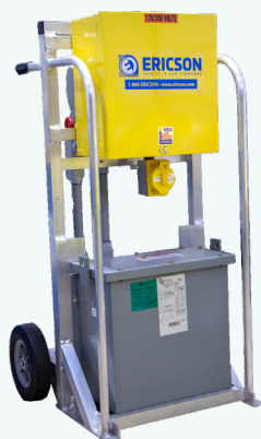
15kVA, 2-Wheel PTU