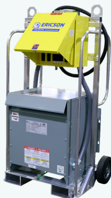
30-45kVA, 2-Wheel PTU