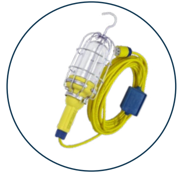
1924-12A-LED-L Vapor Proof Industrial Handlamp