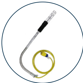
BL500 Boiler Inspection Light