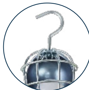
Rugged hook & reflector for demanding applications