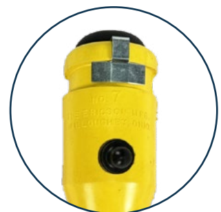
Convenient Switch Available