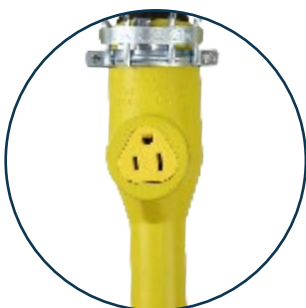
9 series with NEMA5-15 Outlet