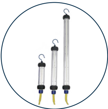
HL Series LED Landlamp