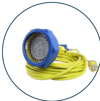
1917,1918,1924 Low Voltage Flood Light