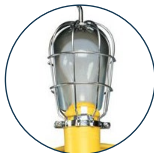
Supports several Lamp Styles